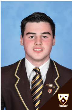
DARCY MONEY APPLIED LEARNING EXCELLENCE AWARD