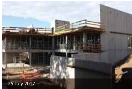
25 July 2017