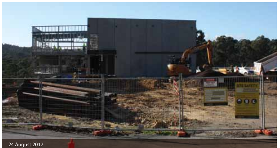
24 August 2017