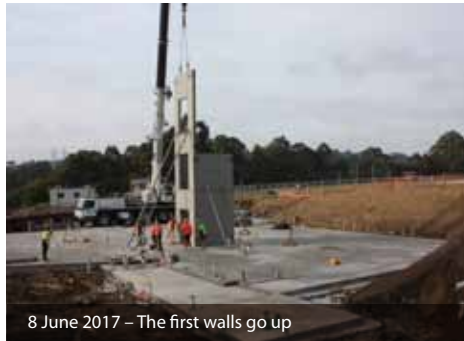
8 June 2017 – The first walls go up