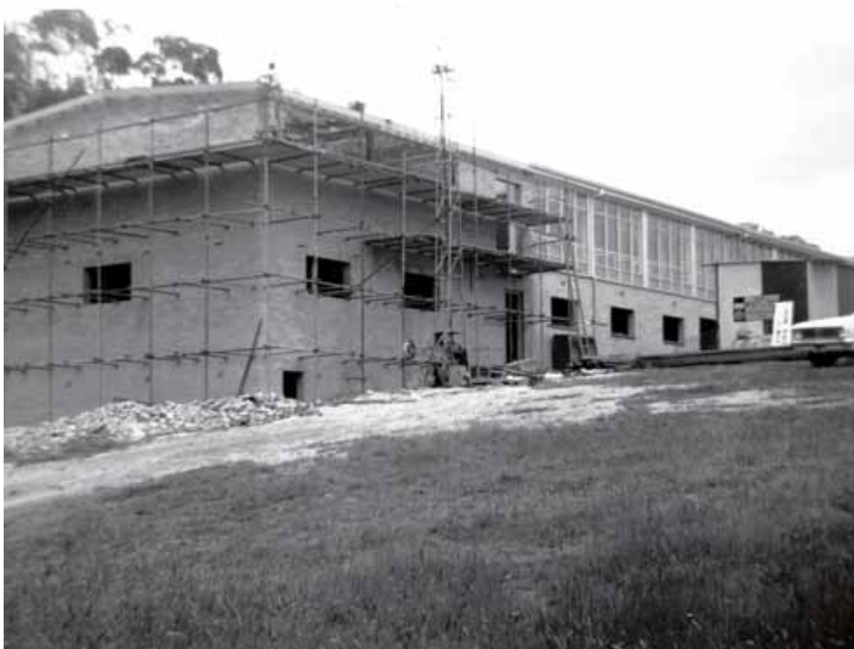
First Science rooms