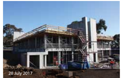
28 July 2017