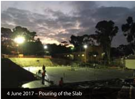
4 June 2017 – Pouring of the Slab