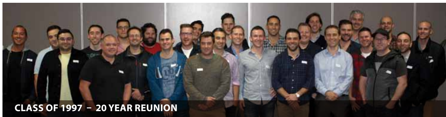
CLASS OF 1997 – 20 YEAR REUNION