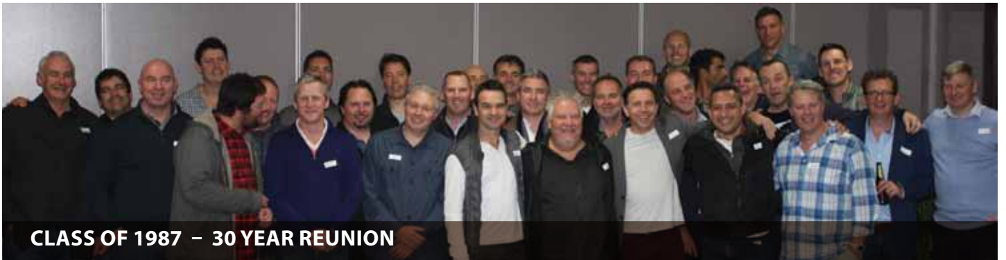
CLASS OF 1987 – 30 YEAR REUNION