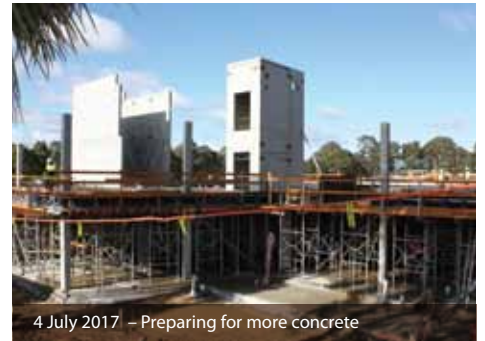
4 July 2017 – Preparing for more concrete