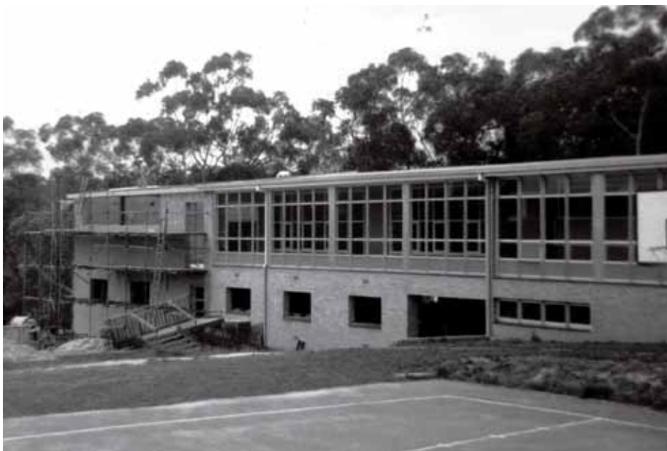
First Science rooms