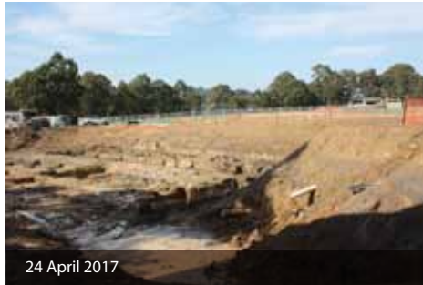
24 April 2017