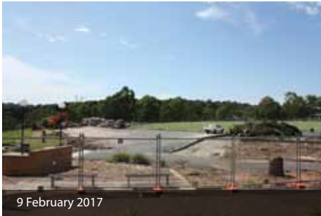
9 February 2017