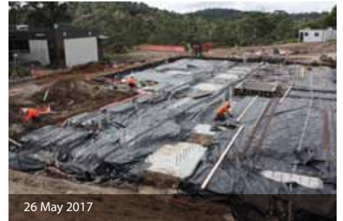
26 May 2017