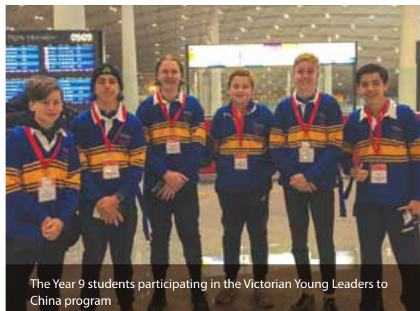
The Year 9 students participating in the Victorian Young Leaders to China program