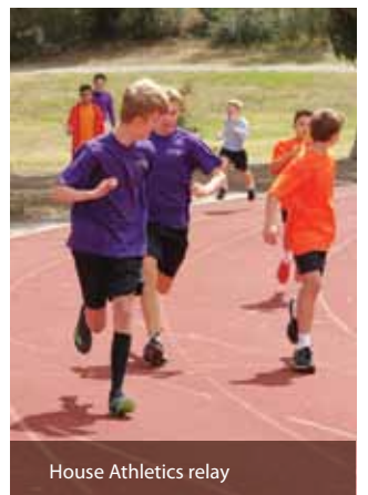
House Athletics relay