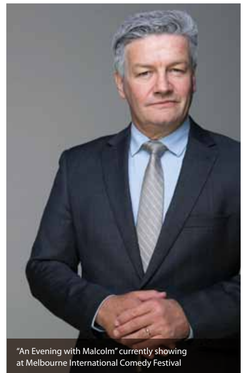
"An Evening with Malcolm" currently showing at Melbourne International Comedy Festival