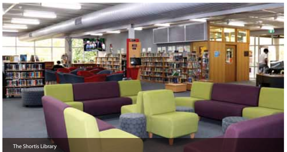
The Shortis Library