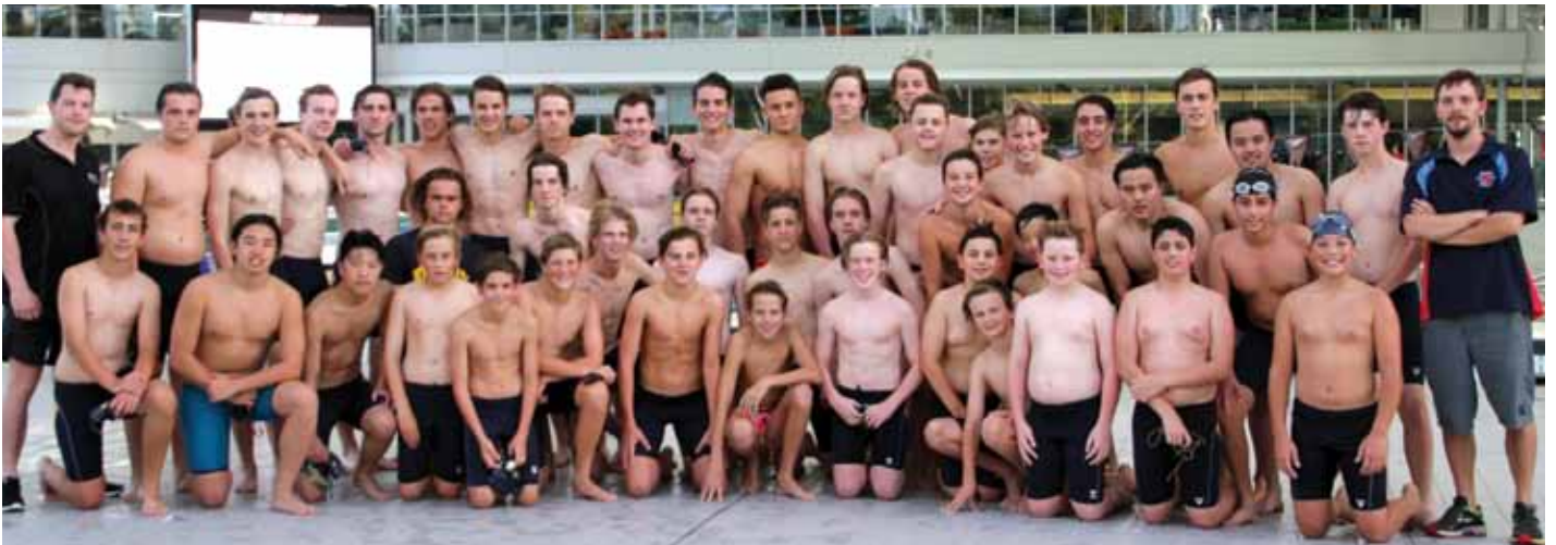
Whitefriars swimming squad