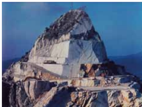
A mountain of Marble in Carrara quarried since antiquity