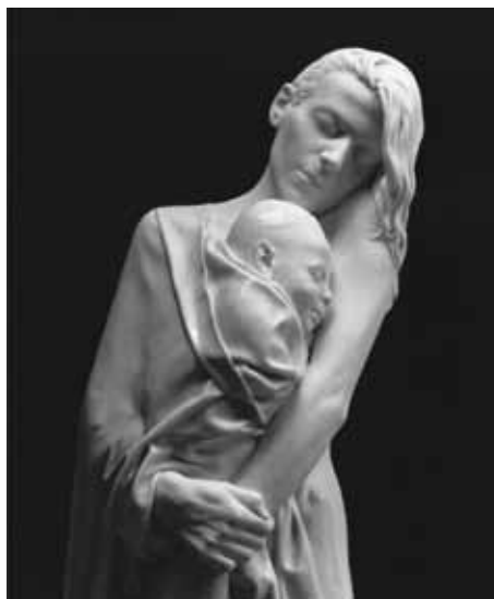
'Mother and Child' [detail] carved 1985-86 in Carrara Statuario Marble Sydney Children's Hospital