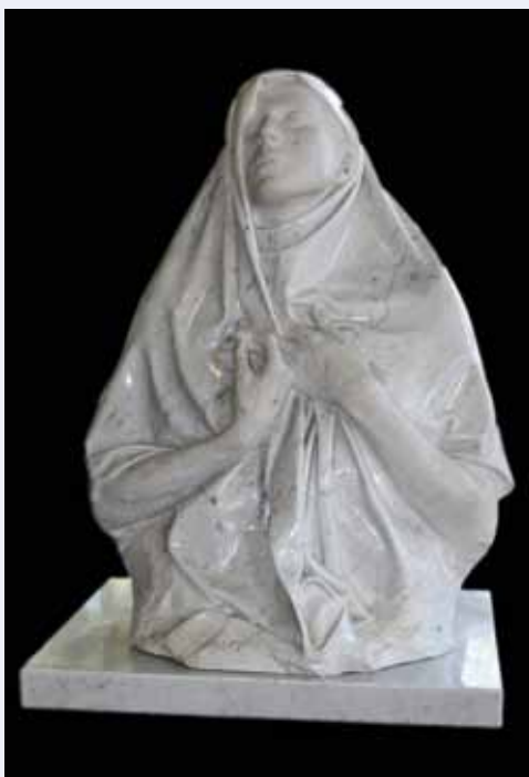
'Madonna' in marble and 'Mary and Jesus' (above) located in the reflective garden at Whitefriars College.