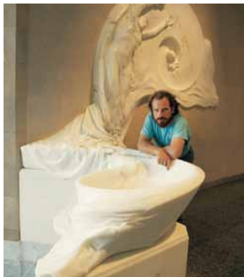
St. Stephen's Cathedral Baptismal Font

In 1979 his was awarded a very generous Italian Government Scholarship to study marble carving at the famous Academia di Belle Arti, Carrara, Italy. This was to be a life changing moment.