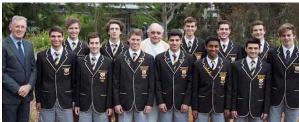
2014 College Captains Junior Captain and Vice Captains and House Captains