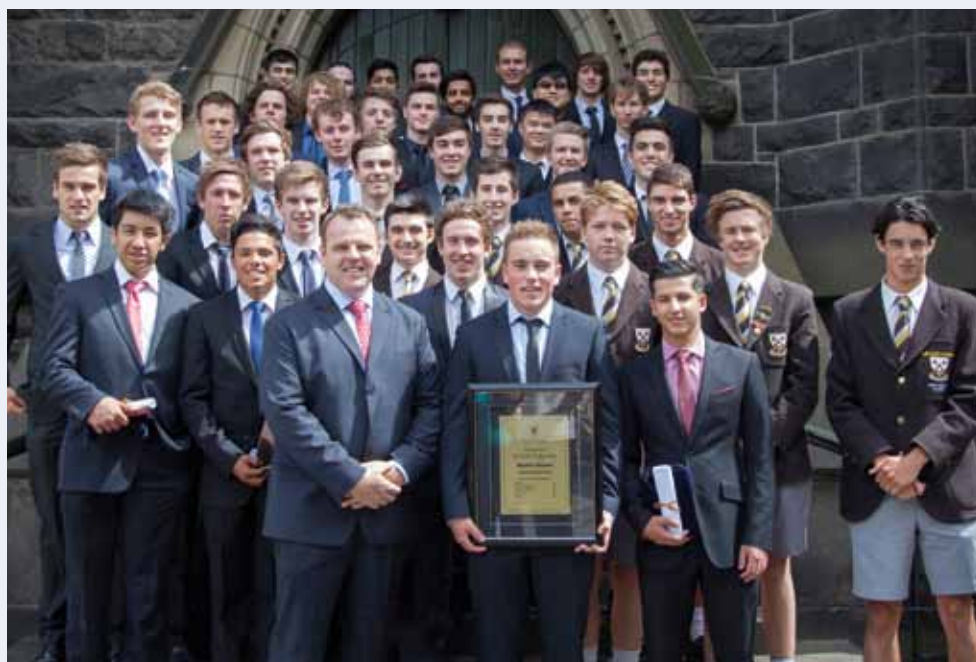
Class of 2013 High Achievers 40+