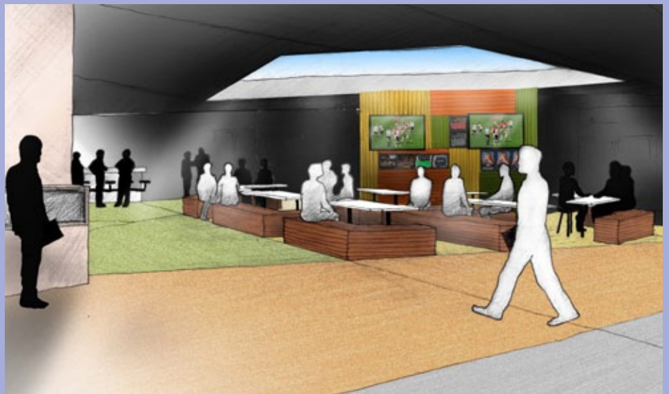
Artist's impression of what The Cameron Centre Canteen could look like

Thank you to the many donors who we acknowledge below, naturally there are some who wish to remain anonymous.