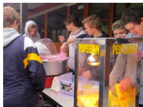
Top and below; food stalls and activities were enjoyed by all on Mt Carmel Day.